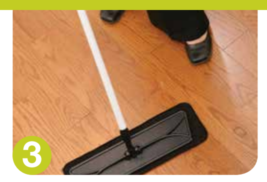
Swiftly wipe the floor surface with the mop, using a to-and-fro motion across the length of the floorboards. Finish cleaning one section before starting on a new area of the floor.

Lightly spray the cleaner on a section of the floor or on the mop cover.